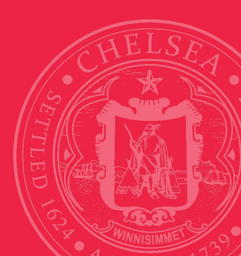
Table of Major Documents